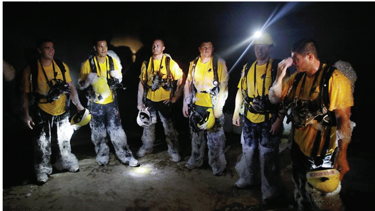
Dragons at the Southern Mines Rescue Station near Wollongong. dailytelegraph.com.au